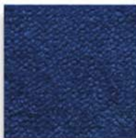
H 557 N.BLUE