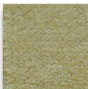
U 329 CREAM