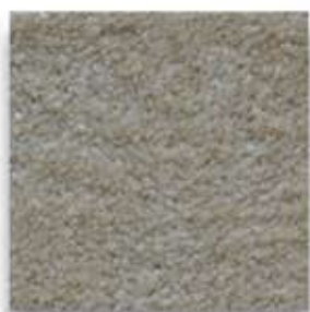
H 591 BEIGE