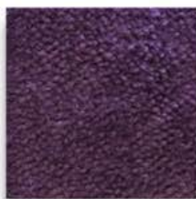
H 586 PURPLE