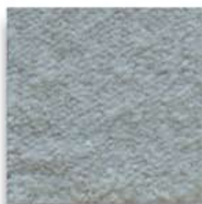
H 590 WHITE