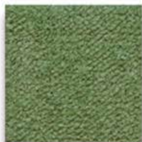
H 565 L.GREEN