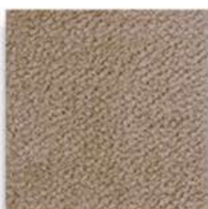
U 921 HONEY