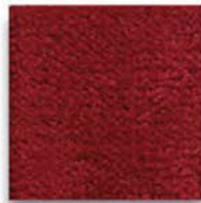
H 521 RED