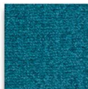
U 620 D GREEN