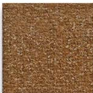
U 412 D BROWN