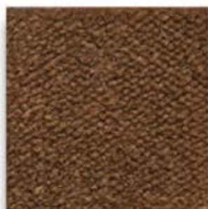
H 593 BROWN