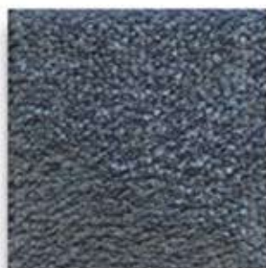
U 084 D GREY