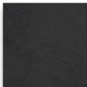
H 579 BLACK