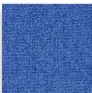
U 511 L BLUE