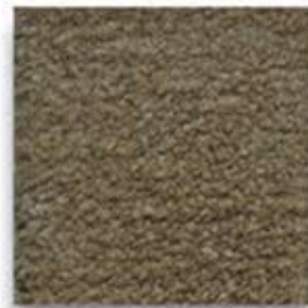
H 545 COFEE