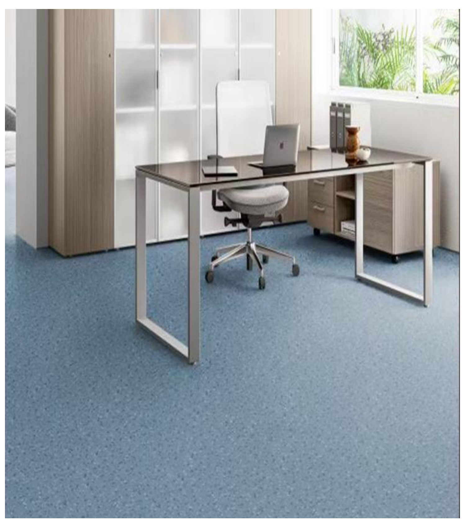
Whether you're renovating your home or outfitting a business or healthcare facility, antibacterial flooring is a smart investment in both style and health.

Antibacterial flooring is a practical and essential choice for maintaining a clean and safe environment. Its ability to reduce bacteria, ease cleaning, and offer durability makes it ideal for high-traffic and high-hygiene areas.